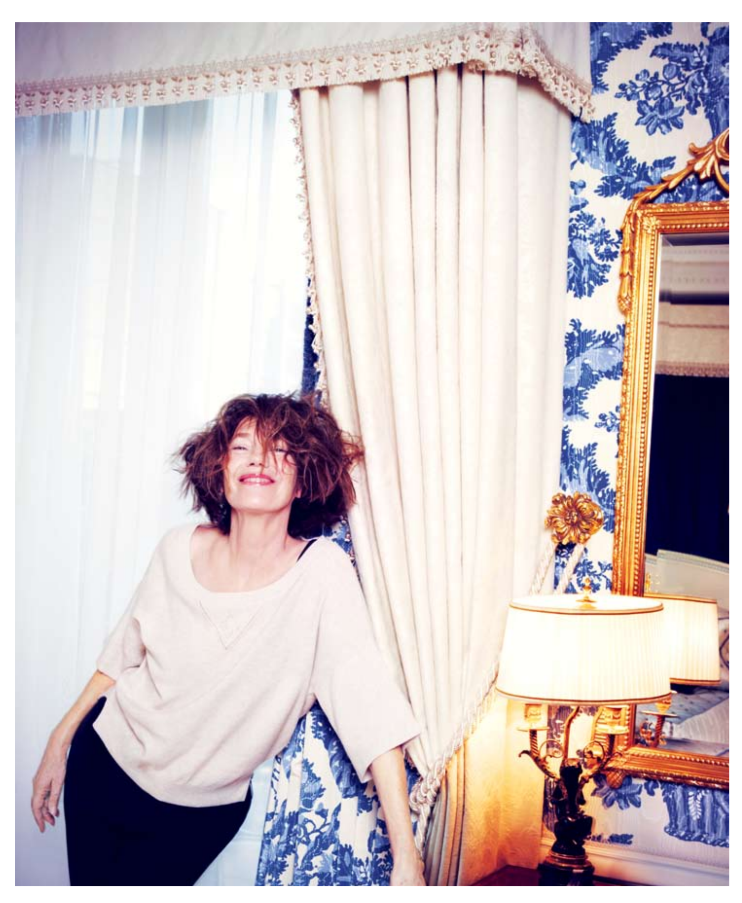
THIS PAGE Hermès sweater, $1150; Willow pants, $395. OPPOSITE Jac + Jack sweater, $399; Emporio Armani pants, $590; heels, as before.