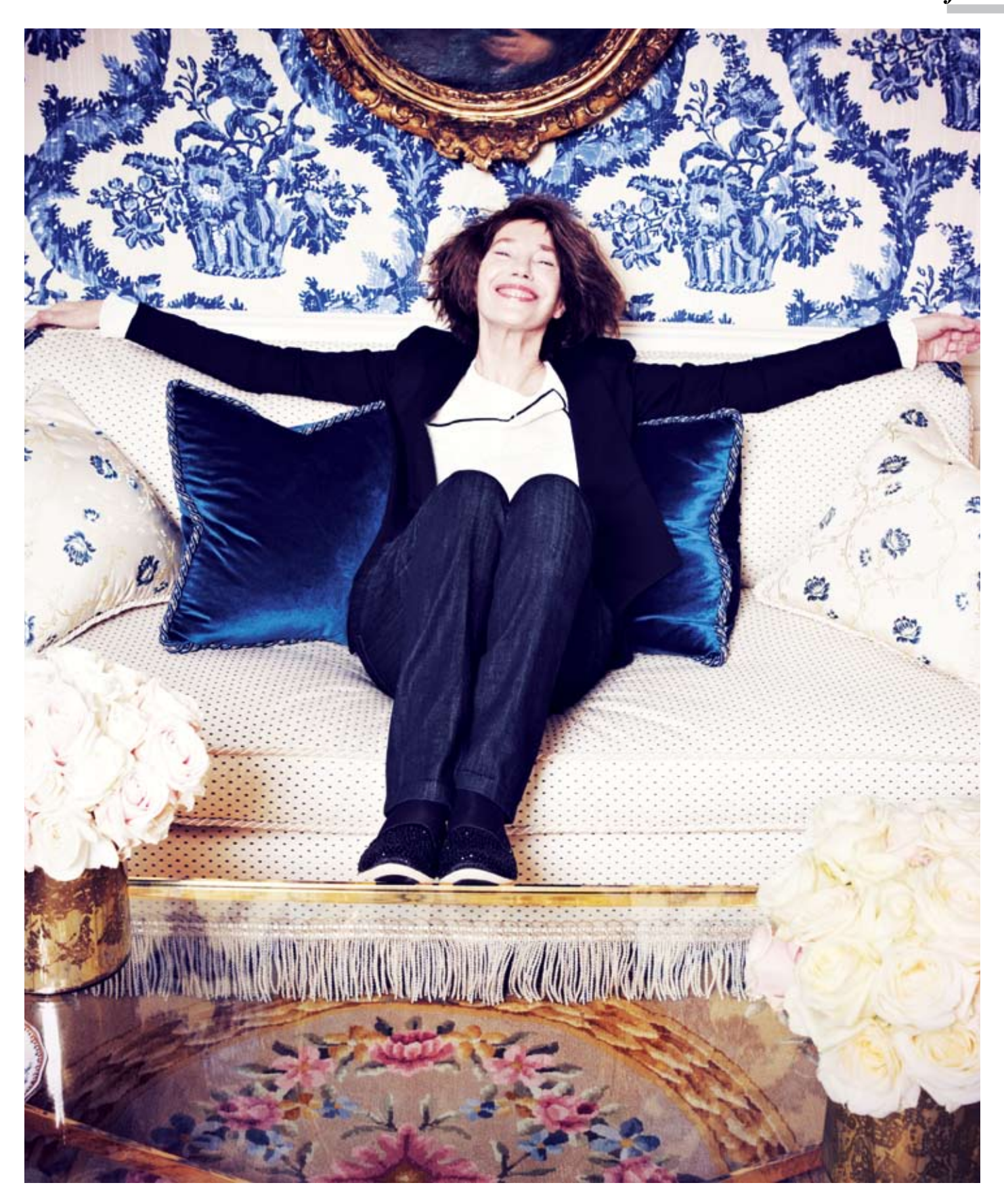
THIS PAGE Superfine blazer, $799; Chanel sweater, $1460; Salasai pants, $220; Voodoo stockings, $17.95 (worn throughout); Thurley shoes, $159.99. OPPOSITE Gant blazer, $1199; Rodeo Show top, $179; Secret Squirrel pants, $249; Moschino Cheap & Chic heels, $305, from My Wardrobe.